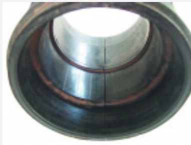
Failed body with longitudinal split

Non-Plasson fittings differ in dimensions and construction from the Plasson range. These differences cause problems when non-Plasson parts are used in replacements on Plasson bodies.