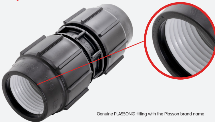
Genuine PLASSON ® fitting with the Plasson brand name

Genuine Plasson ® fittings have been tried and tested in various environments throughout Australia since 1978 and are the basis for reliable performance in the most demanding and rigorous applications, particularly mining.