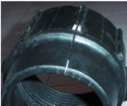
Failed nut with longitudinal split