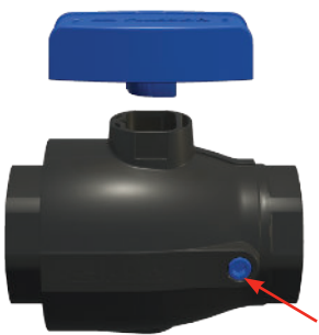
Removable tamper resistant handle

Plasson's Ball Valve is easy to use, tamper proof as well as safe and reliable