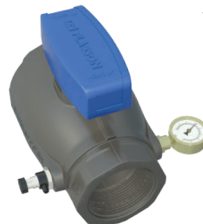
Two drain port option