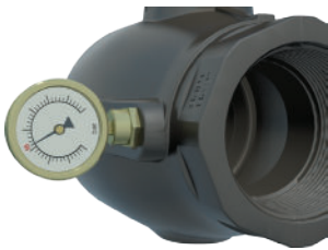
Pressure gauge for monitoring the pressure in the system