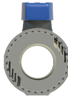
Locked and sealed body parts ensure system integrity