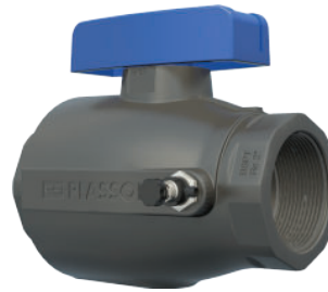
Service valve for sampling or drainage

Plasson's Ball Valve is easy to use, tamper proof as well as safe and reliable