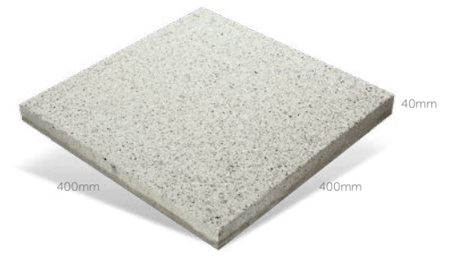
Euro® Stone 6.25 units per m<sup>2</sup>