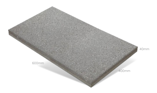
Euro® Stone 600 x 400 4.16 units per m<sup>2</sup>