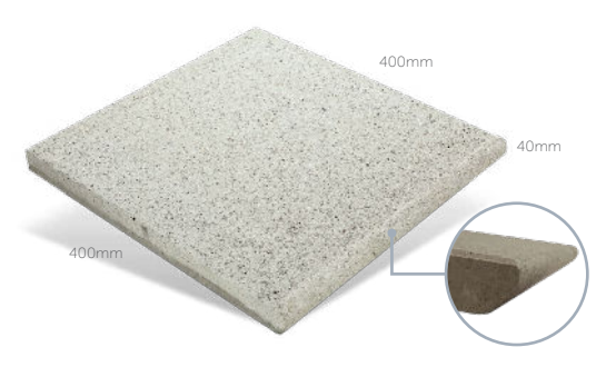
Euro® Stone Sharknose 2.50 units per lineal metre *This product is made to order, lead times apply.