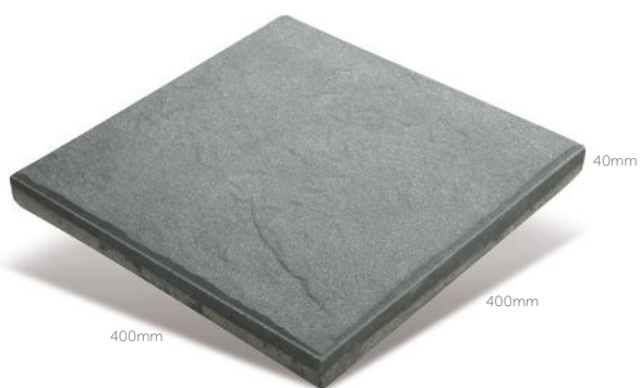
Euro® Slate 6.25 units per m 2