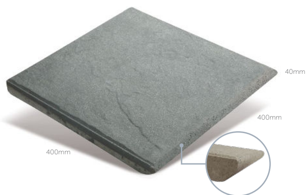
Euro® Slate Sharknose 2.50 units per lineal metre *This product is made to order, lead times apply.