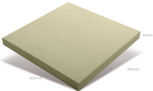
Euro® Classic 6.25 units per m 2