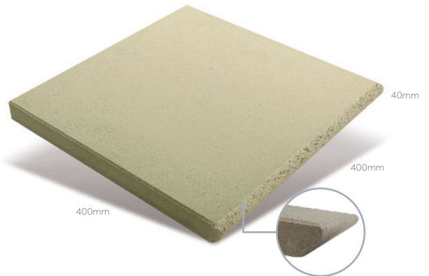
Euro® Classic Sharknose 2.50 units per lineal metre *This product is made to order, lead times apply.