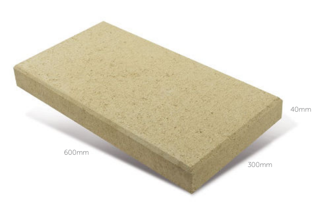
Boulevard® 5.55 units per m²