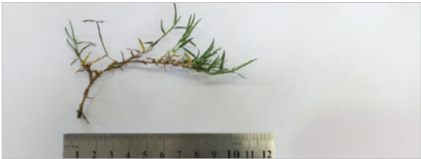
Fig 3. Close-up of live stolon.